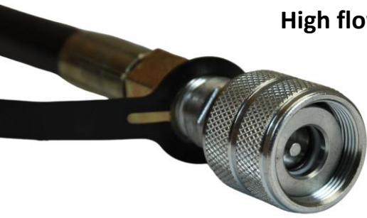
Pump hose end