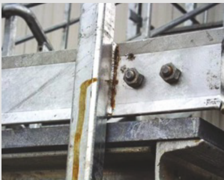
Bleeding and weeping welds