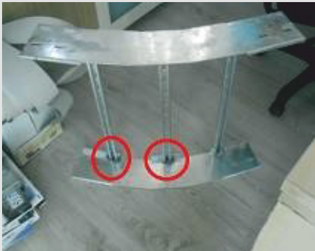
Uncoated areas in welding zone