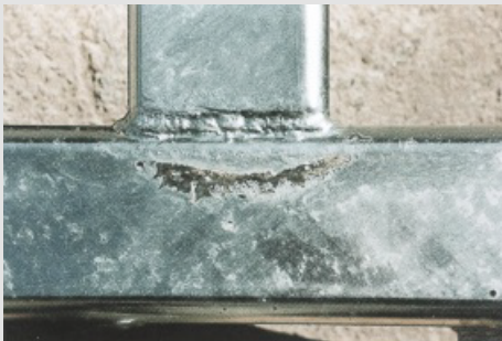
Burned oil during welding