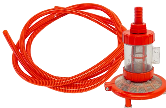
Supply hose with filter