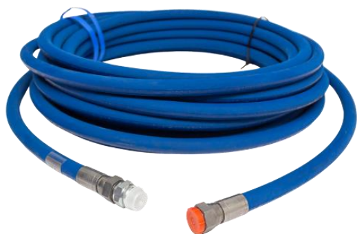
10 meter high pressure hose