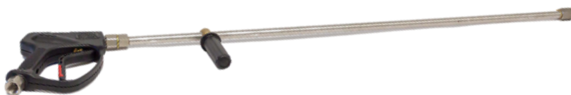
Spray gun incl lance and spray tip