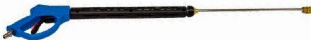
Spray gun incl lance and 4 spray tips