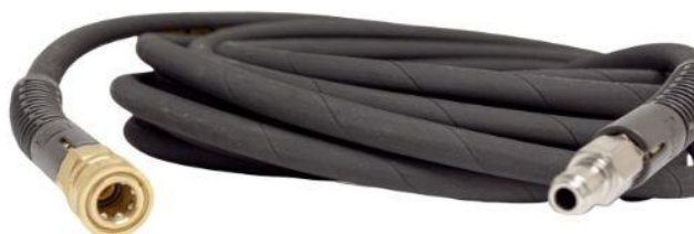
10 meter high pressure hose