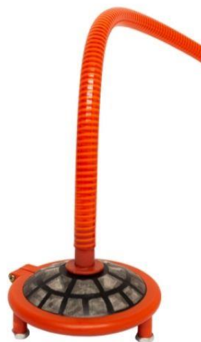
Supply hose with filter