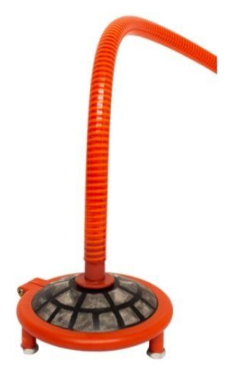
Supply hose with filter