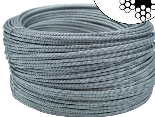
Silk core wire