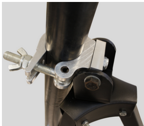
Step 5: Make sure the ring is tightened firmly.