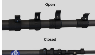
Step 7: Open the clips of the carbon pole to adjust the size of the pole.