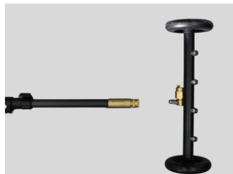
Step 2: Connect 12M carbon pool to the wall crawler.