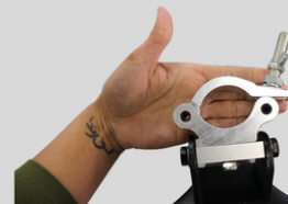
Step 4: open ring to insert 12M carbon pool.