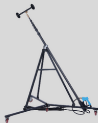
Step 6: Check that all connections are correct.