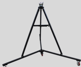
Step 1: Unfold the tripod.