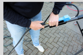
Step 8: connect the high pressure hose to the high pressure machine.