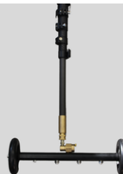
Step 3: check that the connections are properly connected.