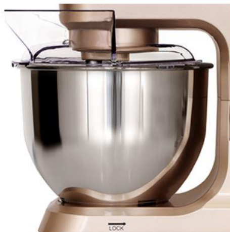
5 Quart Stainless Steel Bowl