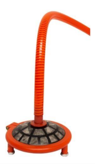
Supply hose with filter